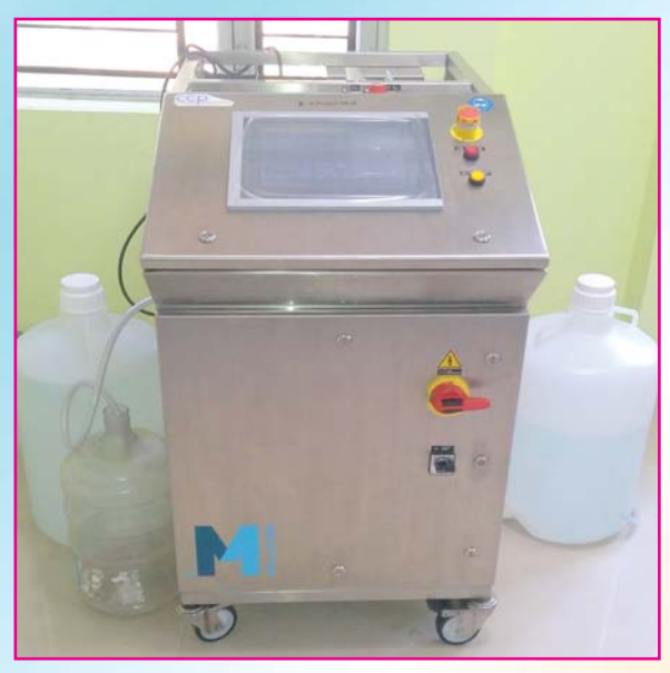
K Prime Chromatography unit