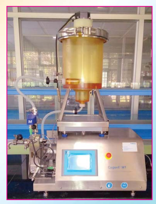
Cogent M1 TFF system

Installation and demonstration of Cogent Micro Scale Tangential Flow Filter (TFF) system, Cogent M1 TFF system, K Prime Chromatography units (Merck) was competed in GBP from 19<sup>th</sup> to 22<sup>nd</sup> Dec 2017. GBP scientific team and along with few students were trained in the utilization of the high end Filtration system and the K-Prime chromatography system. All three systems are ready to be used by in house incubates as well as other users on a pay and use basis.