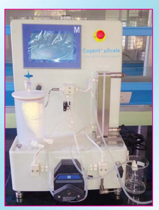
Cogent Micro Scale TFF system