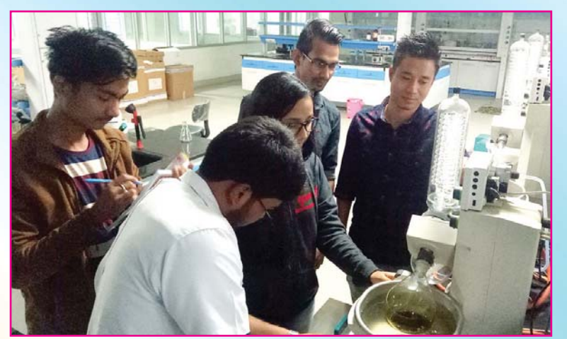
Intern students during their work on Biomolecule profiling

The first batch of interns of winter session-2017 and overall 7<sup>th</sup> batch in the area of 'Biomolecule Profiling' at GBP have done their internship project work during 15-30<sup>th</sup> December, 2017 under the