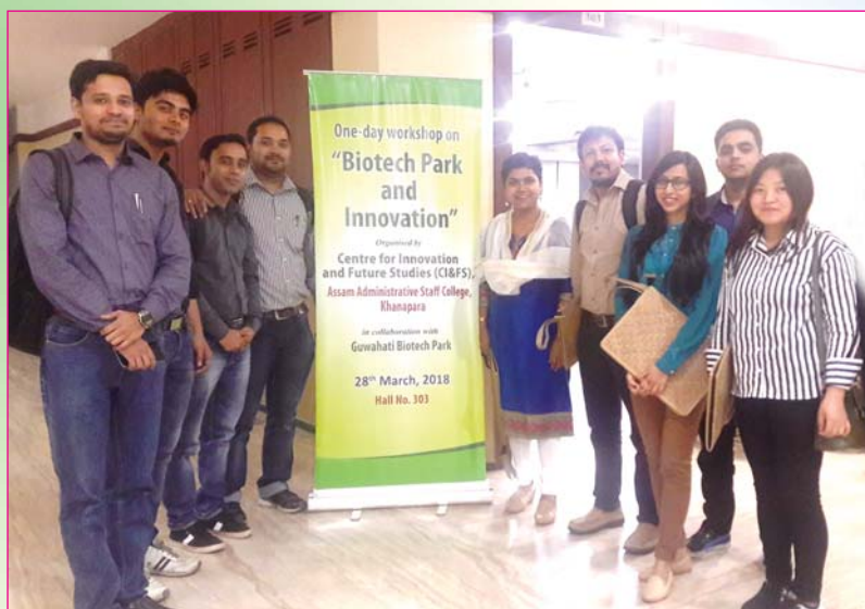
GBP team members and students participating in the workshop on Biotech Park & Innovation at Assam Administrative Staff College, Guwahati