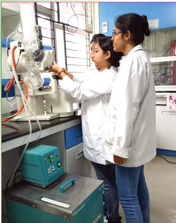
Intern students during their work on Biomolecule profiling at GBP