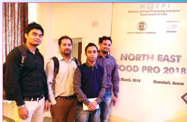
GBP team during North East Food Pro 2018, at Hotel Lily, Khanapara