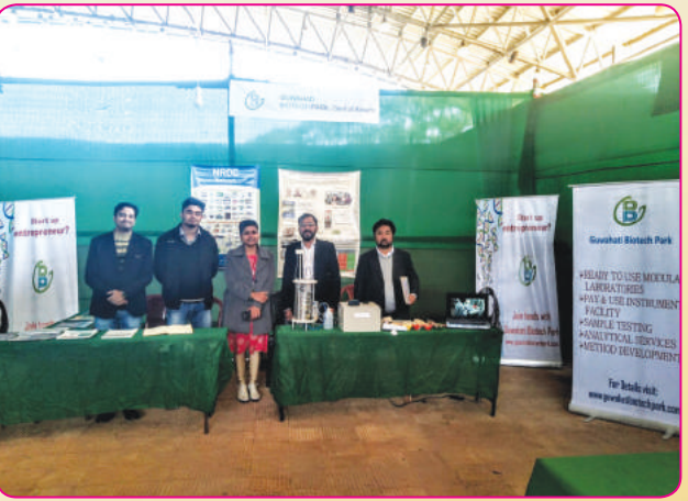
GBP officials and team from Ouija Biosolutions Pvt Ltd at Technology Innovation Entrepreneurship Expo 2019 at NEHU Shillong