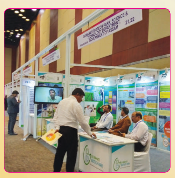
GBP team during their participation at BioAsia 2019