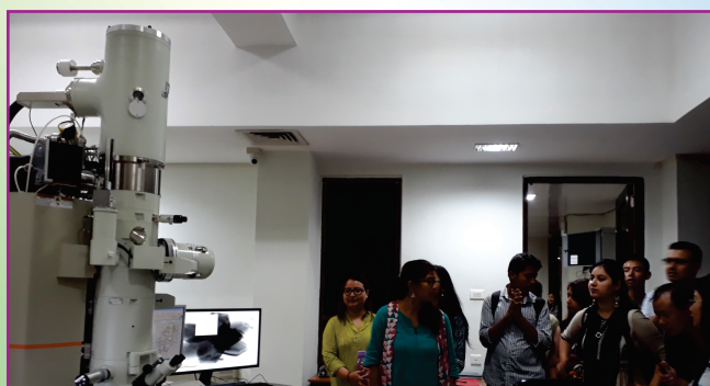
BITP-NES 2018-19 students at CIF, IITG