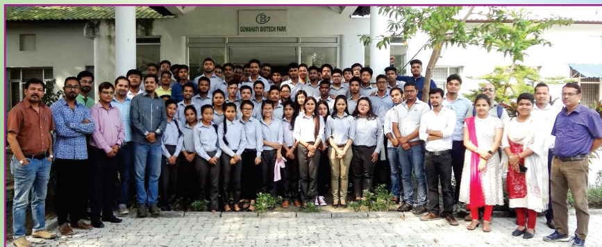
Students and Faculty members of Pratiksha Institute of Pharmaceutical Sciences, Panikhaiti at GBP

60 students of Pratiksha Institute of Pharmaceutical Sciences, Panikhaiti, Guwahati along with faculty members visited GBP on 27th Sept, 2018.