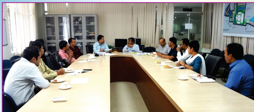
Members of the committee during the meeting at conference hall of GBP