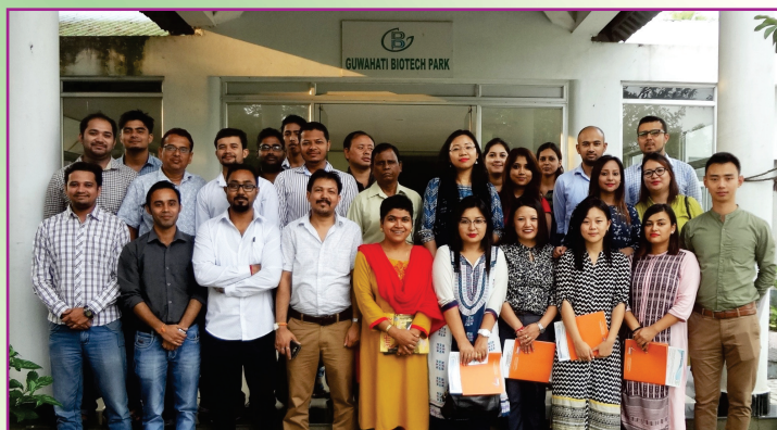
State Civil Service officers of Govt. of Sikkim during the visit at GBP

A group of Twelve State Civil Service officers of Govt. of Sikkim visited GBP on 26th Sept 2018, where they were shown the various laboratory facilities and instruments of GBP. The officers interacted with the Officials and incubates of GBP.