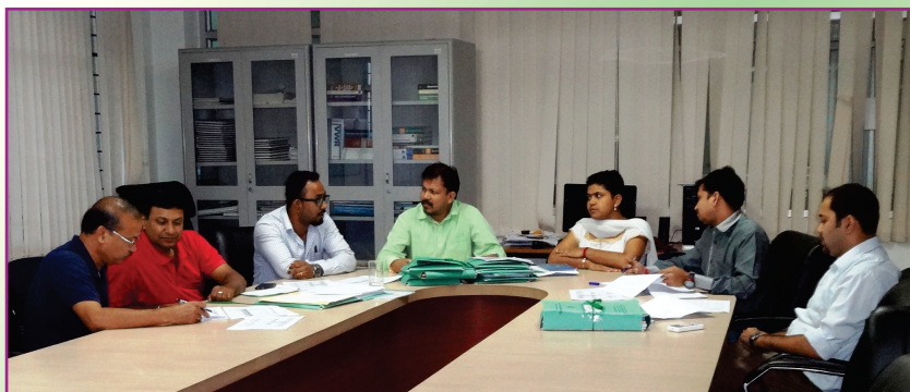
Members of the committee during the meeting at conference hall of GBP

Technical bid Evaluation meeting for equipments to be purchased at GBP was held on 6th Sept 2018.